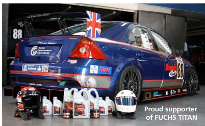
Proud supporter of FUCHS TITAN

Another string of finishes just outside the top 10 have Ashleigh comfortably mid pack in the championship. With a bit of good fortune, she aims to keep climbing.