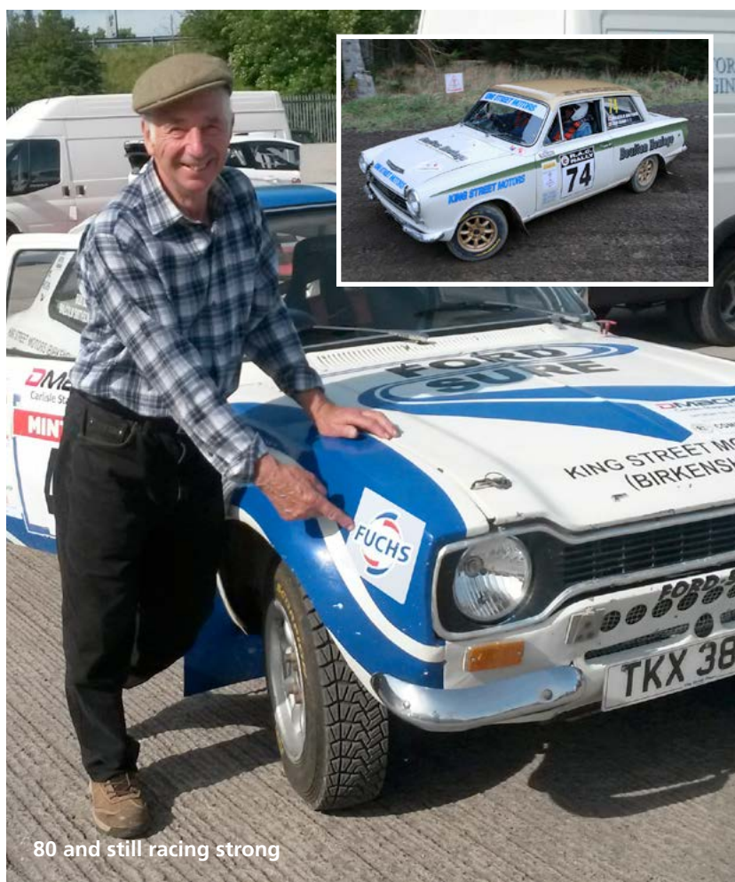
80 and still racing strong