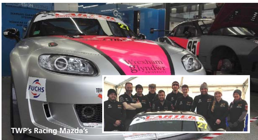
TWP's Racing Mazda's

"To come away from my first full rally in the car with a class podium is really encouraging."