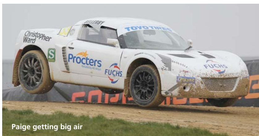
Paige getting big air