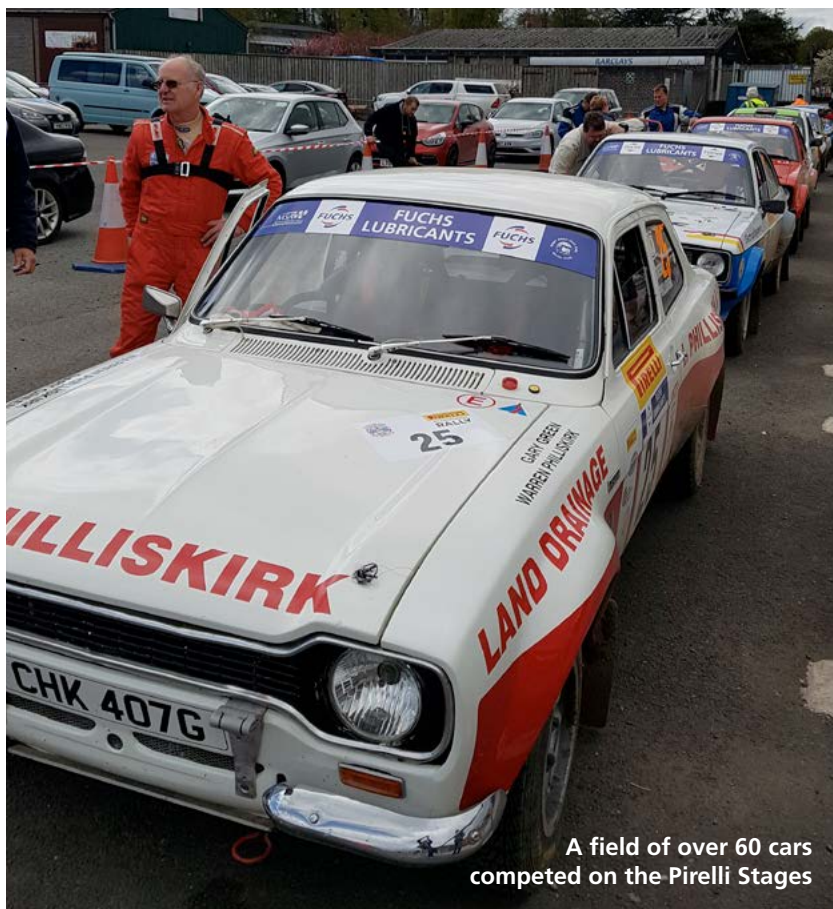
A field of over 60 cars competed on the Pirelli Stages