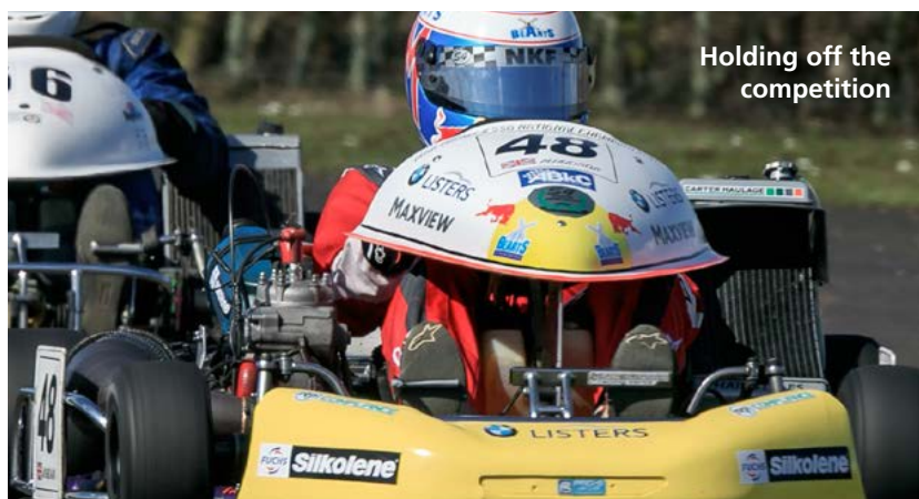
Holding off the competition