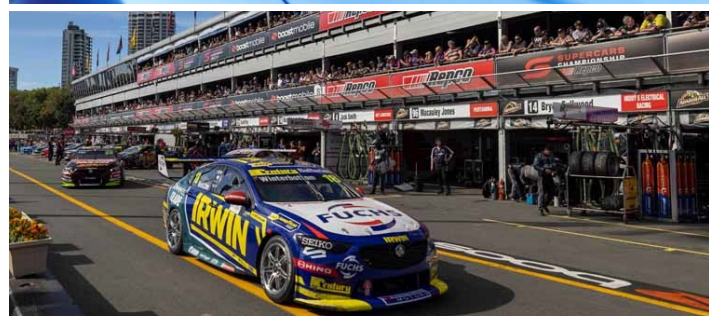
FUCHS lubricants: TITAN RACE SYN 20, TITAN CYTRAC TD 75W-90