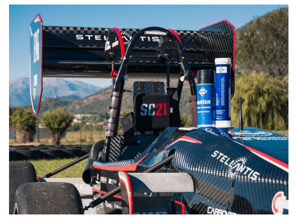
FUCHS lubricants: TITAN ATF 9134 FE, TITAN SINTOFLUID FE 75 W, RENOLIT PU-MA 2, RENOLIT AS