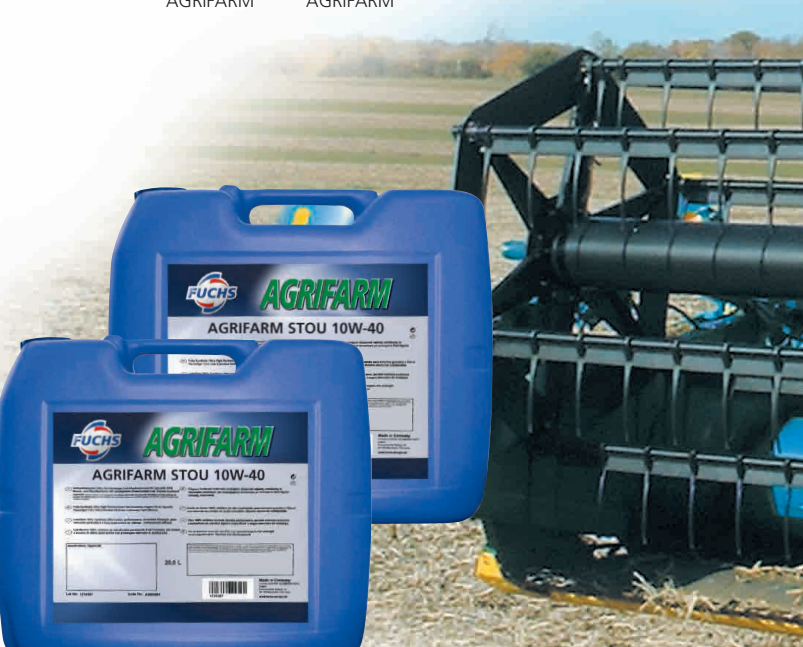
Without FUCHS AGRIFARM