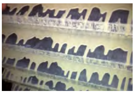
Lubrication film after 6 hours downtime

Global Headquarters FUCHS LUBRITECH GmbH Werner-Heisenberg-Strasse 1 67661 Kaiserslautern/Germany Tel.: +49 (0) 6301 3206-0 info@fuchs-lubritech.de www.fuchs.com/lubritech