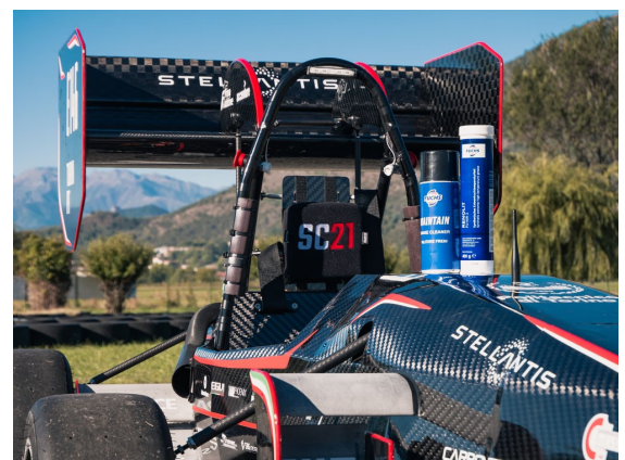
FUCHS lubricants: TITAN ATF 9134 FE, TITAN SINTOFLUID FE 75 W, RENOLIT PU-MA 2, RENOLIT AS