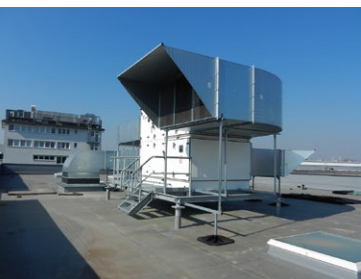
New testing facility – a view of the roof

The hot condensate is pumped from the existing pipeline into two collecting tanks each with a volume of 30 m 3 . From there it is fed to the testing building where it supplies the ventilation systems as well as the radiators and ceiling-mounted air heaters via heat exchangers. In the process, the condensate is cooled to a minimum of 50 °C and then some of it is used as warm condensate to