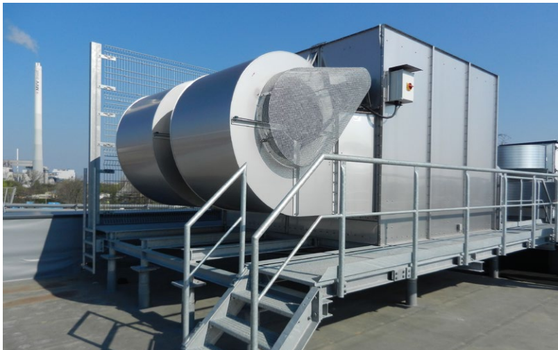
New testing facility – cooling tower

heat a small adjoining building and to keep the cooling tower and an adjacent 900 m 2 storage building frost-free.