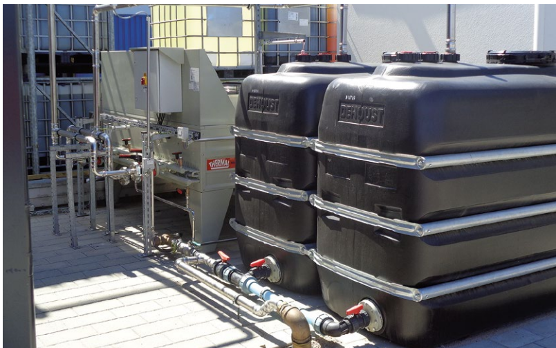
Cold condensate collection with chiller

After this second thermal application, the condensate, now at approx. 30 to 40 °C, flows through a chiller into a cold condensate tank with a volume of 5 m 3 . The fully desalinated water is drawn from the cold condensate tank to feed into the cooling tower as required (max. 4 m 3 /h). The cold condensate is also used to operate an adiabatic exhaust air cooling system, which uses cross-flow heat exchangers to ensure that the supply air for the testing building is pre-cooled in summer thus significantly reducing its need for cooling. Excess condensate is discharged as wastewater.